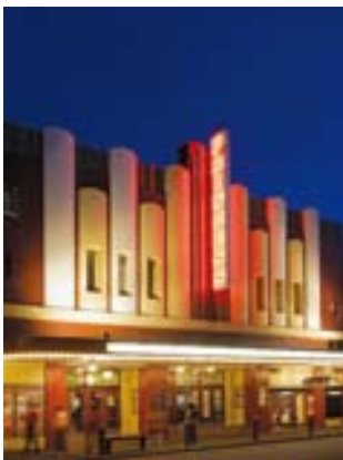
COVER PHOTO: Princess Theatre, Launceston